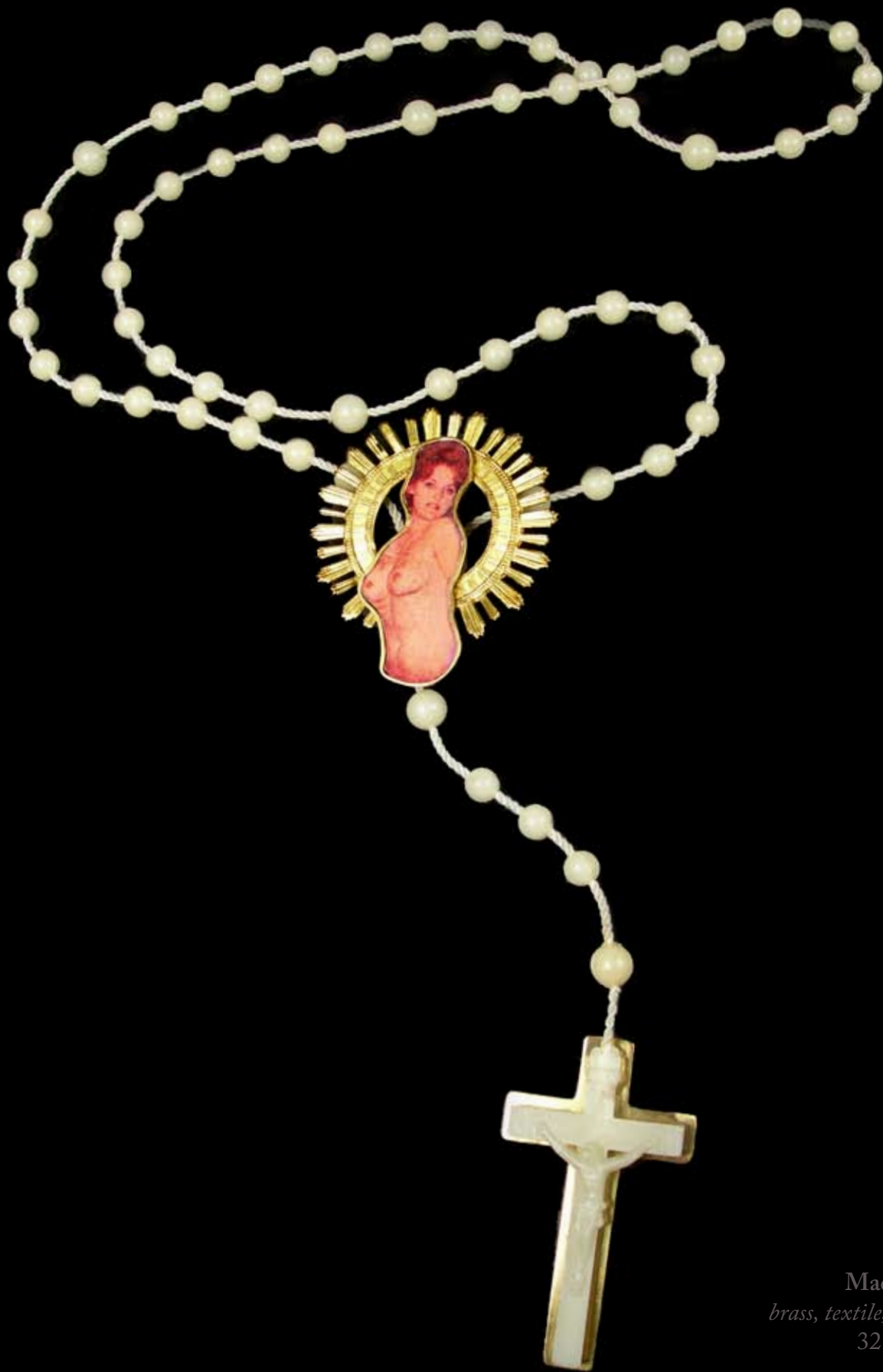
Madonna rosary brass, textile, photo, plastic 32 × 3 × 0,5 cm