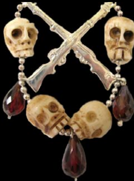
Medal of horror Brooches silver, strass 5,5 × 6 × 1 cm

Even if you don't have to kill anybody, or go to war, wear these medals on your chest. You will appear as a real war Hero!!!