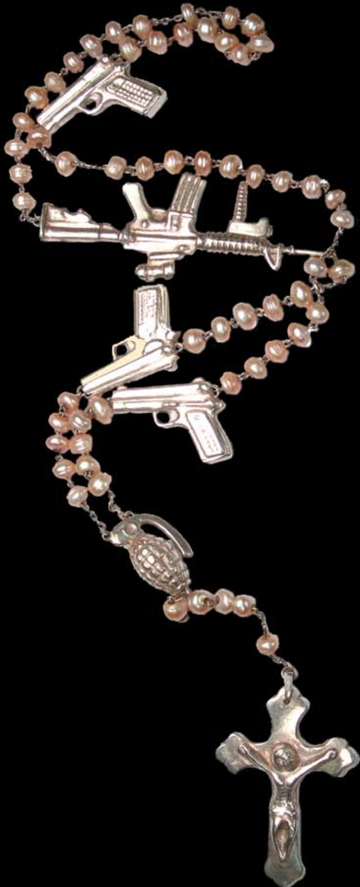
God's Reason rosary silver, pearls 50 × 4 × 1 cm