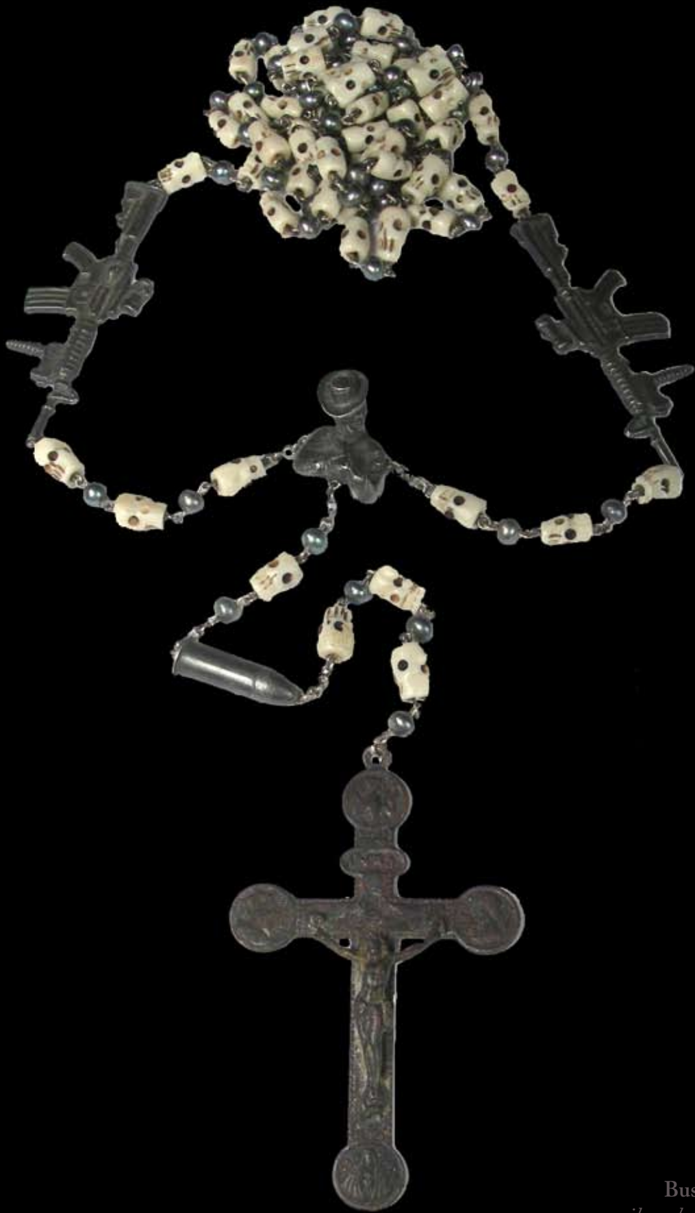
Bush Spirit rosary silver, bone, pearls, metal