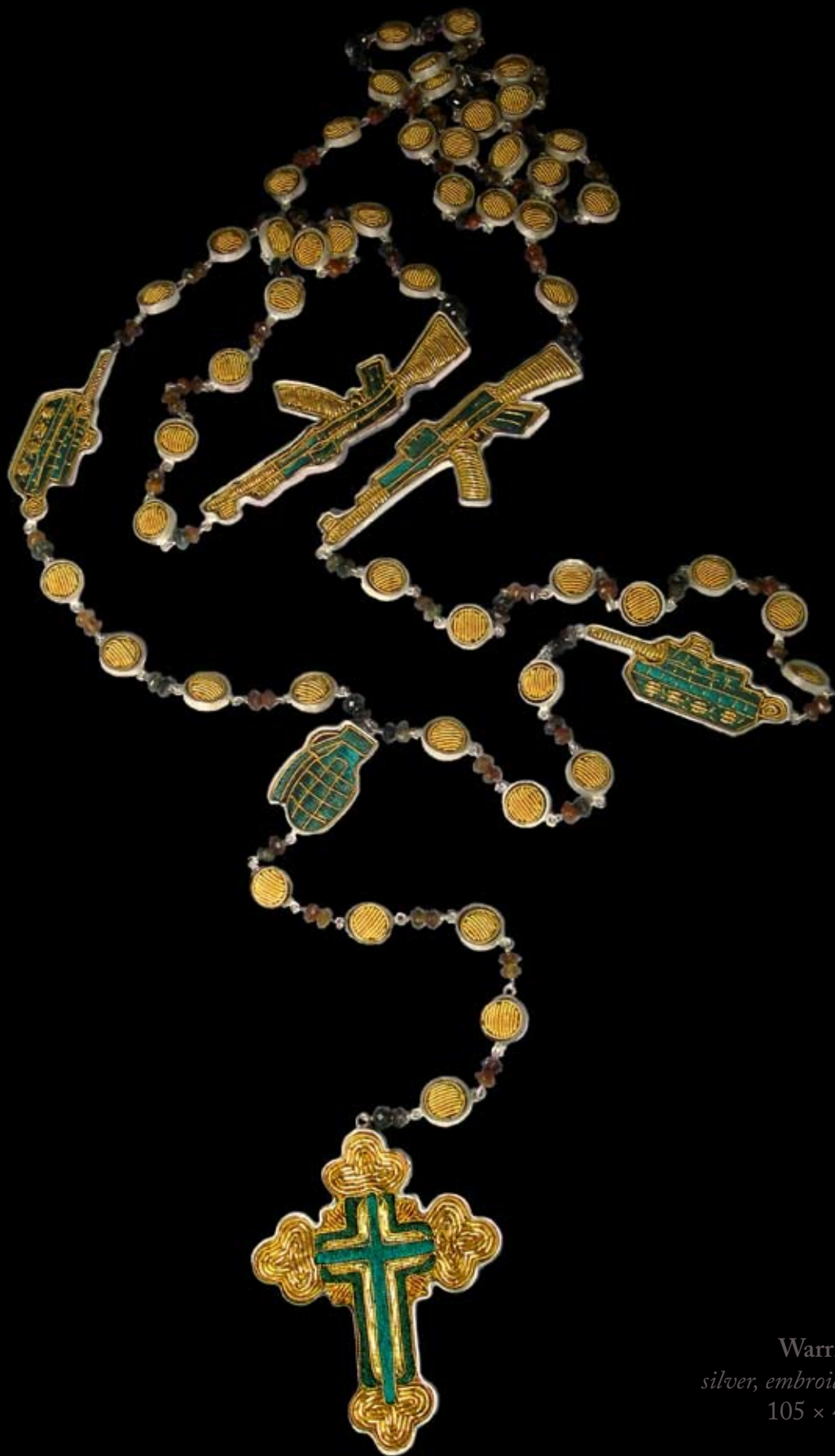
Warriors' rosary silver, embroideries, garnet 105 × 4,5 × 0,5 cm